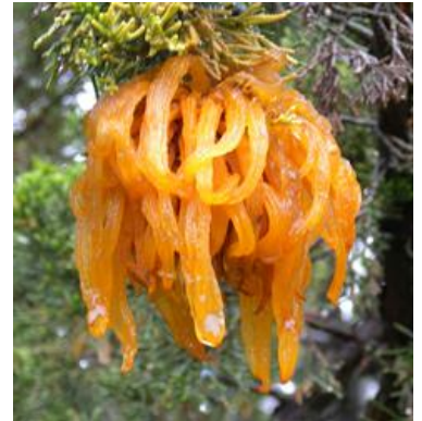
Figure 7 Cedar rust gall with spore horns expanded

We have received photographic evidence in our Plant Clinic email this week to show that the cedar rust galls are producing their telial spore horns and producing spores. I went to my back window to check my neighbor's poor juniper. On Tuesday morning, I could not see any spore horns, but by Wednesday noon, I did not need the binoculars to confirm the horns are expanded. They are fully expanded due to the rain this week (fig. 7). All three cedar rusts (cedar-apple, cedar-hawthorn and cedar quince) are active now. If you have not started protective sprays on the deciduous host, it is time to get going!