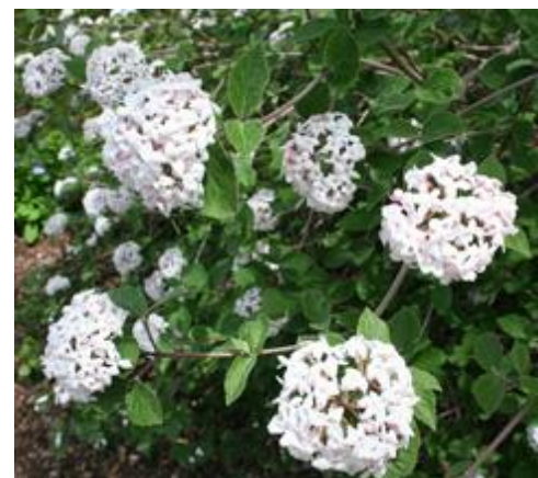
Figure 1 Korean spice viburnum in flower