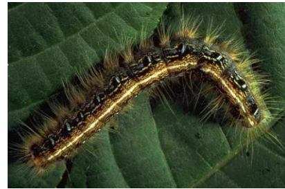
Figure 3 Eastern tent caterpillar

http://www.mortonarb.org/trees-plants/tree-and-plant-advice/help-pests/tent-or-web-making-caterpillars