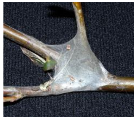
Figure 2 Tent of Eastern tent caterpillar

Eastern tent caterpillar ( Malacosoma americanum ) has not been spotted yet, but it is a pest that often starts to show up at GDD 100-200. When they start to emerge, look for small tents beginning to form. The larvae gather at a fork in a tree and build a web or “tent” (fig. 2), but at this point you may need to look carefully to spot it. The caterpillars will ultimately grow to two inches long and are hairy with white stripes down their backs and blue spots between longitudinal yellow lines (fig. 3) (these markings will not be as distinct on the young caterpillars). They leave the web to feed during the day, but return at night. Severe defoliation only occurs when populations are high.