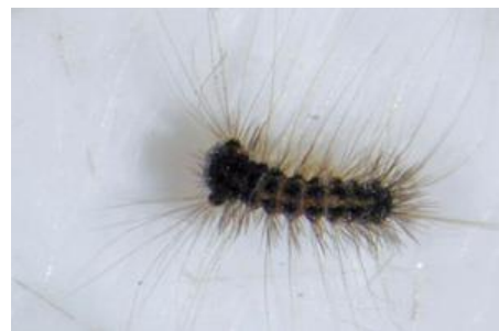
Figure 5 Early instar of gypsy moth caterpillar

We don't have reports to indicate that the beetle larvae are active at this time. Last year, however, we did find larvae emerging between 100 and 150 GDD, base 50. Be checking viburnums now. We often see the larvae feeding on leaves that are only half open.