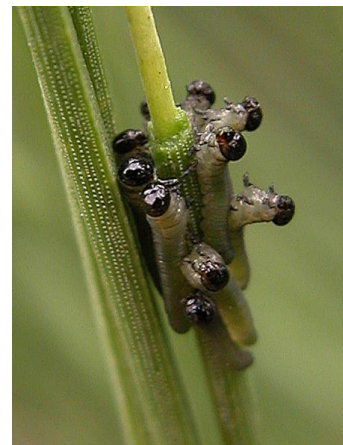
Figure 4 European pine sawfly larvae

Another pest to expect around GDD 100-200 is the European pine sawfly ( Neodiprion sertifer ). When the larvae come out, they will be very small at first. Look at the ends of branches, as the eggs were laid in last year's needles. If you can't find any larvae, check the needles for unopened eggs. This insect can cause heavy defoliation on red, Scots, mugo, Japanese red, and jack pines. European pine sawflies are interesting to watch. Groups of sawfly larvae rear up their heads simultaneously when disturbed, making the group appear to be one much larger organism. This is a great defense mechanism. When fully grown, the sawflies will be about \frac{3}{4} - 1 inch long and will have several light and dark green stripes on each side of their bodies (fig. 4). Their heads and the three pairs of legs are black. Their mouths are so small after hatching that they can only eat one side of each needle, and therefore the chewed-on needles look like straw.