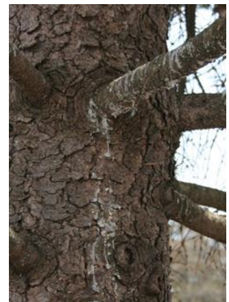
Figure 8 Sap flow from cytospora canker

Management: Cytospora canker is a stress-related disease, so, at minimum, trees should be kept mulched and watered well during dry periods. Remove infected branches promptly during dry weather to reduce the spread of the disease. It is imperative to disinfect pruning tools between cuts. Give spruces adequate space when planting as dense planting is another common predisposing stress factor. If it is necessary to remove trees, it would be wise to consider diversifying the planting, rather than replanting with a lot of spruces. Having a lot of the same plant in the landscape can magnify a disease problem. There is no effective chemical control.