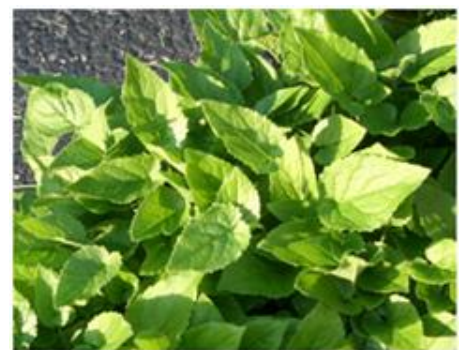
Figure 10 Leaves of creeping bellflower

For the last few years, we have been receiving reports of an annoying weed making itself known in flower gardens and lawns. Those complaints often come later in the season when this weed starts flowering, but we have already received two emails about creeping bellflowers