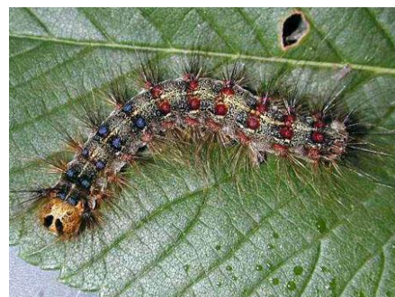
Figure 6 Mature gypsy moth caterpillar