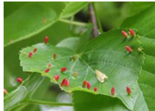
Figure 9 Spindle galls on linden

Galls are starting to show up on some of our favorite plants. The vast majority of galls are harmless, but they are included here so you can learn to recognize them in the landscape. No control measures are needed.