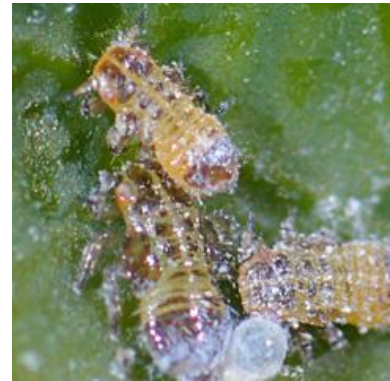
Figure 6 Boxwood psyllid nymphs

Boxwood psyllid ( Cacopsylla buxi ) is showing up around the region. The psyllids overwinter as tiny orange eggs in the bud scales of the boxwood. As the buds open, the psyllids hatch and begin to feed. The nymphs (fig. 6) are about 1/16th of an inch long, yellowish, and partially covered with a white secretion that protects them from parasitoids and chemical sprays. Their feeding causes cupping of the leaves. If your boxwood had this pest last year, the foliage from last year will show cupping. We have already had several reports of this pest of boxwoods.