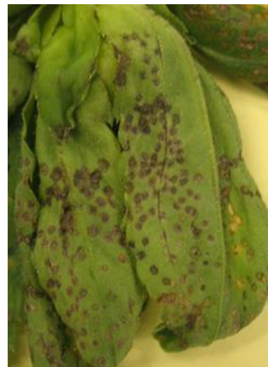
Figure 4 Damage from four-lined plantbug

Be looking for the four-lined plantbug ( Poecilocapsus lineatus ). The nymphs are out, and we are seeing feeding damage on a variety of plants. This insect feeds on 250 species, including many kinds of perennials, vegetables, and shrubs such as bluebeard, forsythia, and sumac. Feeding injury is frequently mistaken for leaf spots. Four-lined plantbugs have piercing, sucking mouthparts which they use to break plant cells and then flush the feeding wound with digestive juices. Damage appears as dark leaf spots (fig. 4) which subsequently turn translucent. The damage is more serious on herbaceous plants than on woody plants. Sometimes by the time the damage is noticed, the insect isn't there anymore. Both nymphs and adults feed on leaves, creating the spots.