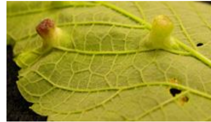
Figure 10 Hackberry nipple gall

a bit like miniature cicadas. Hackberries are the only known host of this psyllid. The psyllids are also called jumping plant lice because of their ability to jump. Hackberries frequently get nipple galls. As a matter of fact, I was taught to identify hackberries ( Celtis spp.) by their warty leaves caused by the galls as well as their warty bark. The damage is not considered serious.