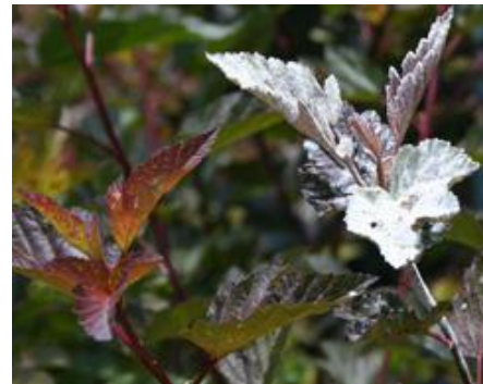
Figure 11 Powdery mildew on ninebark

Powdery mildew on ninebark ( Physocarpus opulifolius ) is already being reported regularly to us this year. The straight species of ninebark is relatively resistant to powdery mildew, but some of the cultivars can be very susceptible and can sustain quite a bit of damage. Hundreds of plant species are susceptible to powdery mildew, but the disease is caused by many different species of fungi which are host specific. This means that the powdery mildew on coralberry will not infect lilacs and so forth.