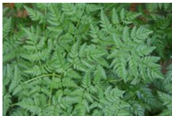
Figure 14 Foliage of poison hemlock