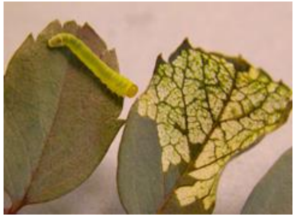
Figure 2 Rose slug sawfly larvae and damage

Management: Minor infestations of rose slug sawfly (or friends) can be controlled by using a forceful jet of water to dislodge the sawfly larvae or by handpicking. Although this insect looks like a caterpillar, it is not, so Bacillus thuringiensis var. kurstaki (Btk) will NOT control this pest.