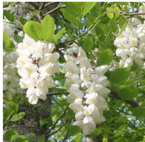
Figure 1 Black locust