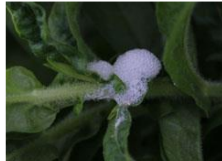
Figure 8 Spittlebug

Just this week, I found spittlebug on several perennials in my own garden. They can be identified by the frothy white mass (fig. 8) they produce on foliage and twigs. It does look quite a bit like spittle. Spittlebugs suck plant sap but inflict little damage on mature plants. There are a number of species of spittlebugs that feed on a variety of plants.