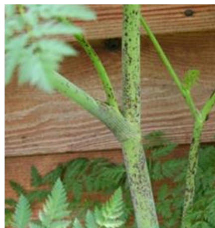
Figure 13 Spotted stem of poison hemlock