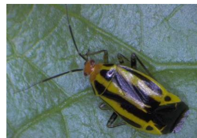
Figure 5 adult four-lined plantbug

Nymphs are red and will develop dark wing pads as they mature. We are seeing them at this time. The adult stage (fig. 5) is 1/4" to 1/3" long and has four longitudinal black lines on its yellow or green back, thus the name. It's quite a shy insect that scurries away when you try to find it. The insect overwinters as eggs laid in slits cut into plant shoots. There is one generation per year.