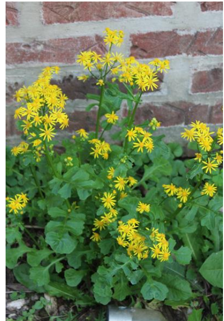
Figure 15 Butterweed

These two plants are related; they belong to the same genus. They are butterweed ( Packera glabella ) and golden ragwort ( Packera aurea ). Butterweed is a native of Illinois, but is far more common in the southern half of the state than it is in the Chicago region. Yet, we have had numerous reports of it this year. Last year I found one in my yard. This plant does well in partial to full sun and is reported to prefer a loamy soil, with moist to wet conditions. The one in my yard was growing up against the chimney in an area so dry and hard I have not even attempted to garden there. I was so impressed by this plant's tenacity that I let it stay there. Butterweed is actually fairly attractive, with yellow daisy-like flowers, that provide nectar for pollinators. It flowers for 6 to 8 weeks. The leaves are interesting too, being deeply and irregularly cut (fig. 15). Those leaves contain alkaloids which prevent rabbits and deer from feeding on them.