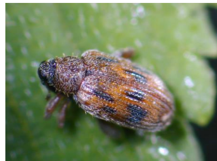
Figure 7 Adult elm flea weevil

Elm flea weevil ( Orchestes steppensis ) (fig. 7) is being reported on elms. This pest has been in our area for nearly 20 years and has regularly caused foliage damage to elms during that time. Adult-feeding results in tiny shot holes in the leaves, and heavy feeding can cause newly expanding leaves to wither and turn brown. After feeding, the female weevil cuts a cavity into the leaf mid-vein and inserts an egg. The hatching larvae create blotch mines at the leaf tips. Larvae feed for about 2-3 weeks, and then pupate within the mined leaf. Very heavy feeding can reduce photosynthetic capacity of the tree, thereby impacting overall tree vitality. Dr. Fredric Miller tells me that "the elm flea weevil, for some reason, prefers Siberian elm and any hybrids that contain U. pumila in their genetics."