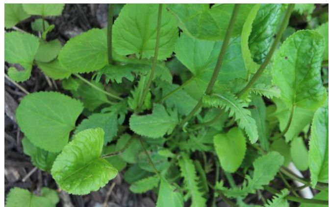
Figure 16 foliage of golden ragwort

Golden ragwort is a cousin to butterweed and has similar yellow flowers that also provide for pollinators. The basal leaves of this plant are oval to almost rounded, with rounded teeth. Leaves higher on the stem are much smaller, narrower and deeply dissected (fig. 16). The leaves of this plant also contain alkaloids. I actually found this one for sale at a local garden center and bought it just to see how it would grow in my yard. It is doing well. It has already flowered and is making a lot of seeds for me.