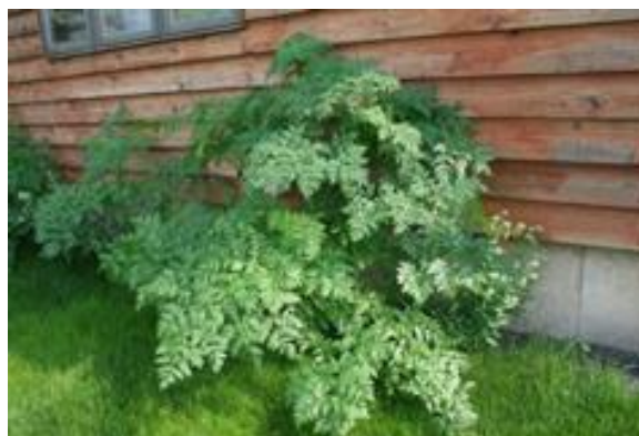
Figure 12 First season growth of poison hemlock

https://www.extension.purdue.edu/extmedia/fnr/fnr-437-w.pdf